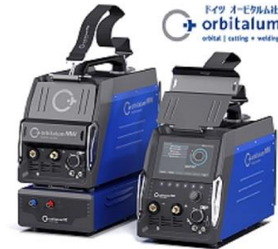
Orbitalum Automatic Pipe Welding Machines for High-Purity Pipe Welding in Semiconductor and Other Fields

In welding system engineering, we leverage our proprietary technologies to propose integrated system packages that incorporate peripheral equipment to address customer challenges. We can also offer collaborative robots and various other automation solutions.