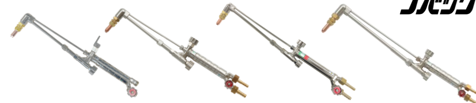
Medium Cutting Torch Z Trigger Medium Cutting Torch Z Medium Cutting Torch U45 II A Type Cutting Torch Z