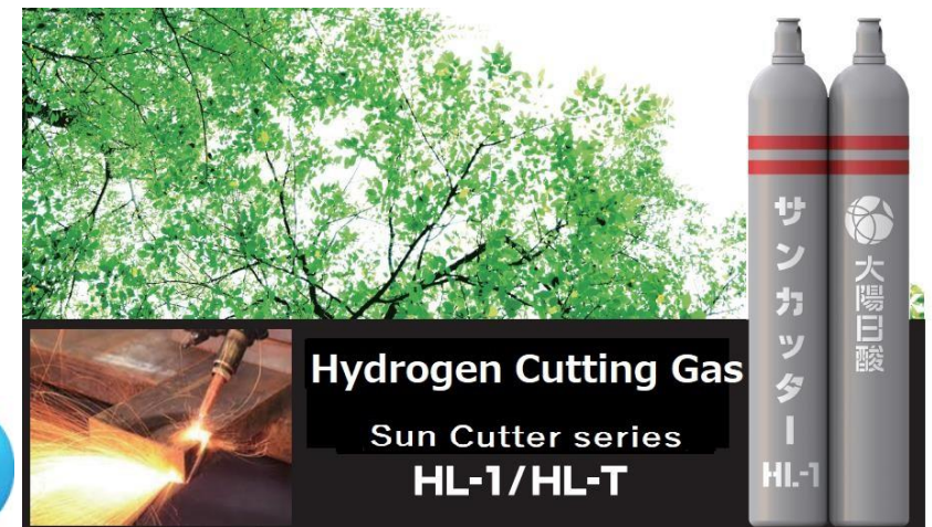
Hydrogen Cutting Gas Sun Cutter series HL-1/HL-T