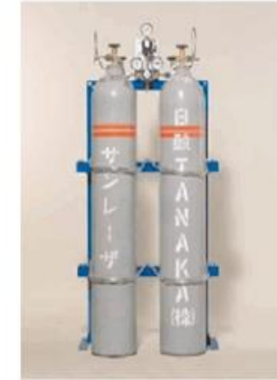
Laser Gas Supply System for Stable Gas Supply to CO 2 Laser Cutting Machines

Hydrogen gas cutting significantly reduces CO 2 emissions and fuel gas consumption, making it an essential solution for a carbon-neutral society. We conduct on-site demonstrations.