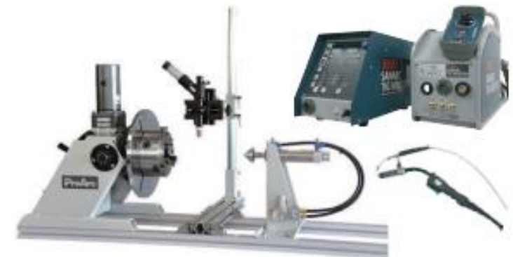
High-Efficiency Semi-Automatic TIG Welding System [Sanarc TIG Meister] Equipped Rotating Pipe Welding System Package