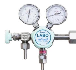
S/LABO S Products with Antibacterial and Antiviral SIAA Mark Certification

Internationally, we are strengthening our sales infrastructure in Southeast Asia, supported by our factory in Thailand and a marketing base in Vietnam.