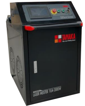
Fiber Laser Welding Machine with Three Functions: Welding, Cutting, and Cleaning [FLM-2000W]