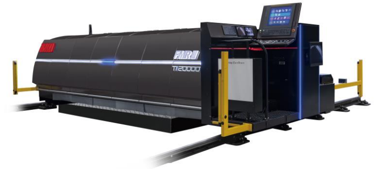
The latest fiber laser cutting machine “The All-New” that revolutionizes cutting [FMRⅢ]

With sales offices in China and the U.S., we are expanding our sales activities in Korea, the U.S., and the Southeast Asian region, focusing on laser cutting machines.